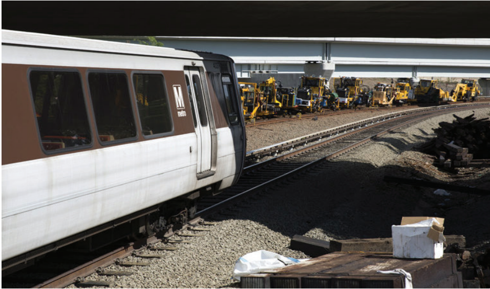
Transit systems earned the lowest mark in the report card. (David Kidd)

But it's not all bad news. The American Society of Civil Engineers reports that some types of infrastructure have improved.